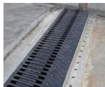
Sliding Finger Joints