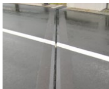
Single Gap Joints